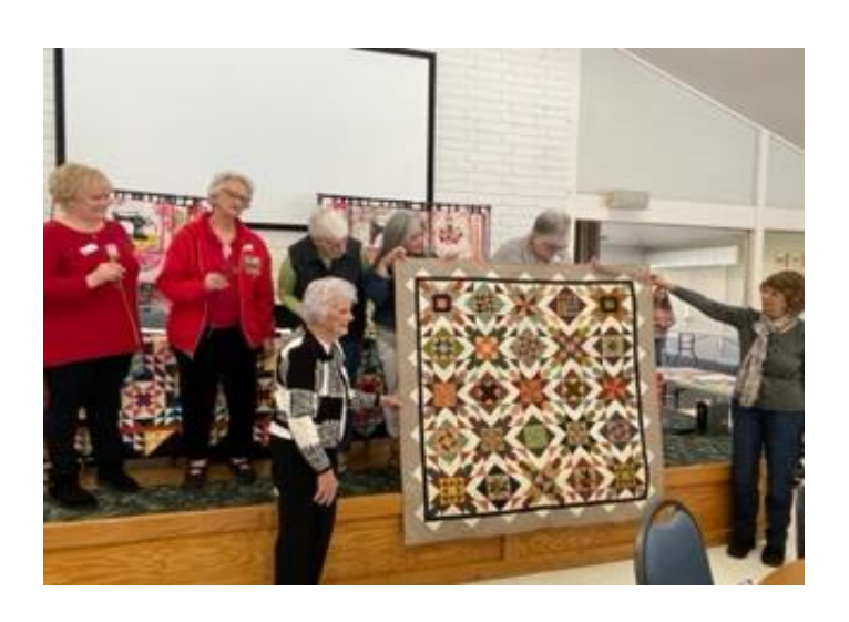
Installation of Incoming Officers